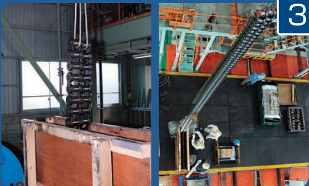
Chain is packaged folded on top of itself. Attach one end to a crane and lift out for easy removal.