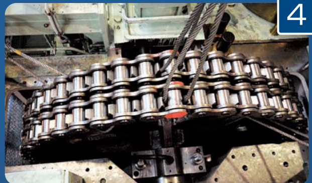
Safer, simpler, and more reliable installation to equipment!