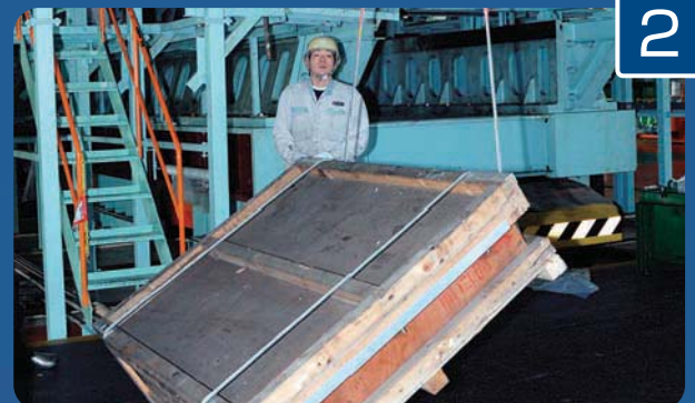
Stand wooden box upright when removing chain. (Be careful when standing wooden box.)