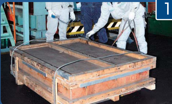
Chain is packaged in a special wooden box and delivered horizontally.

Super long length formation makes installation sa