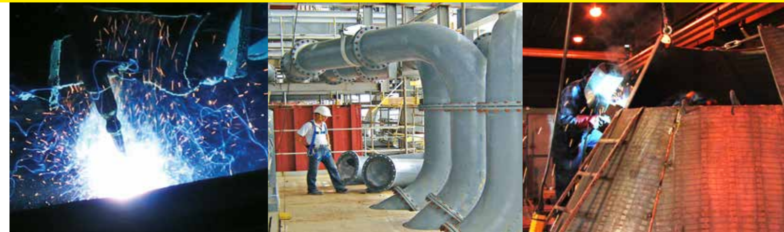
KALMETALL TC combined with KALOCER high alumina ceramics as pipe brick material

KALENBORN OFFERS A COMPREHENSIVE RANGE OF METALLIC WEAR PROTECTION WHICH INCLUDE: