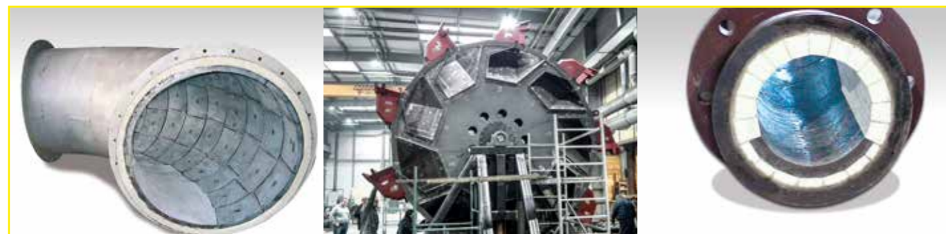
KALCAST and KALCRET Use in a shredder system for plastic waste